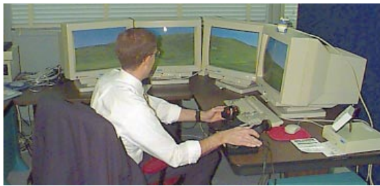
4 Wide field-of-view helicopter navigation trainer.