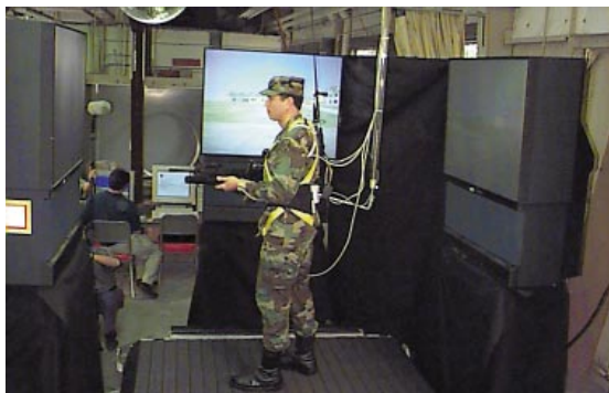
5 NPSNet-IV and the Omni-Directional Treadmill.