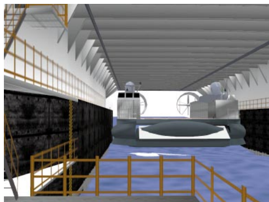
7 Inside the LPD-17 with the amphibious vehicle.