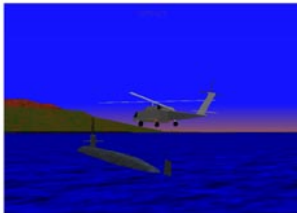
Figure 3 - LA-Class Submarine & SH-60B ASW Helicopter Trainer