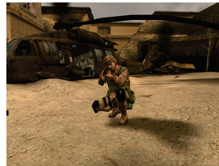
Special Forces soldier on CSAR (combat search-and-rescue) mission