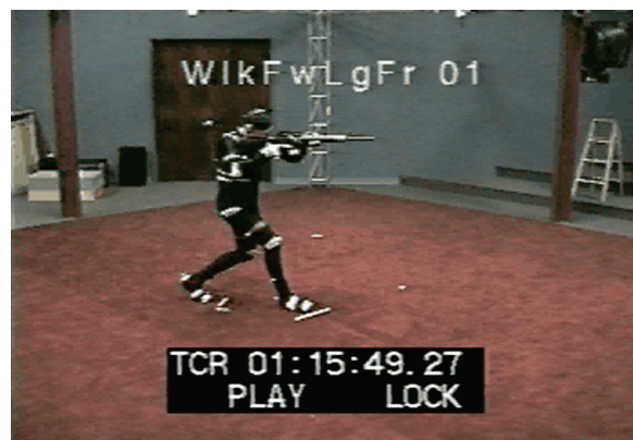
Raw motion-capture video of a soldier stalking with an M-16

pared with other shooters, reminds the player that the Army proper is not a game.