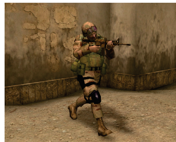
All dressed up and somewhere to go: skinned, equipped, and animated online

To ensure equal advantage, much investigation went into matching up rival weapons. Where the Americans employ M-16 assault rifles, for example, the enemy carries AK-47s, the nearest real-world equivalent, with the AK-47's higher caliber and firing rate duly reflected. You can capture and fire enemy weapons, which results in twisty visuals: if you drop your M-16, the other side sees you drop an AK-47, and if they pick up your weapon, they see it as an AK-47 and you see it as an M-16 that fires like an AK-47. This isn't a bug, but a conundrum proceeding from the premise that though you've captured a weapon with a faster firing rate, all your weap-