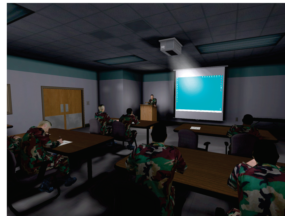
Medic training—all play and no work makes Jack a bad soldier