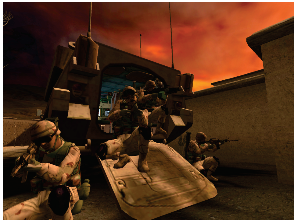
Drop your sword. A combat brigade bursts from a Stryker in the AA online game

Although recruiters tried on a number of appeals over the last thirty years (“Be All You Can Be,” “Get an Edge on Life,” “An Army of One,” etc.), these campaigns failed to resonate with their audience because they no longer spoke the language of the young. Until recently, enlistment fell short of annual goals.