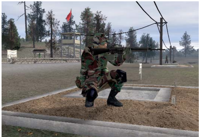
Figure 3. Training simulator. Despite the initial evaluator’s skepticism, America’s Army proved to be an effective military training simulator. Soldiers who played the rifle range segment of the game, for example, earned improved scores on the real-life rifle range.

in a highly immersive, highly addictive game—we called this our “first person education” grand challenge, a play on the phrase “first person shooter.” 6