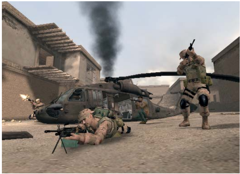
Figure 2. America’s Army . The most widely used and successful serious game to date, this title initially served as a recruiting tool.

These comments led us to wonder how much of K-12 science and math education could be taught via games and how we might exploit students’ capability for collateral learning —the learning that happens by some mechanism other than formal teaching. Ultimately, we wondered if we could incorporate all K-12 science and math education