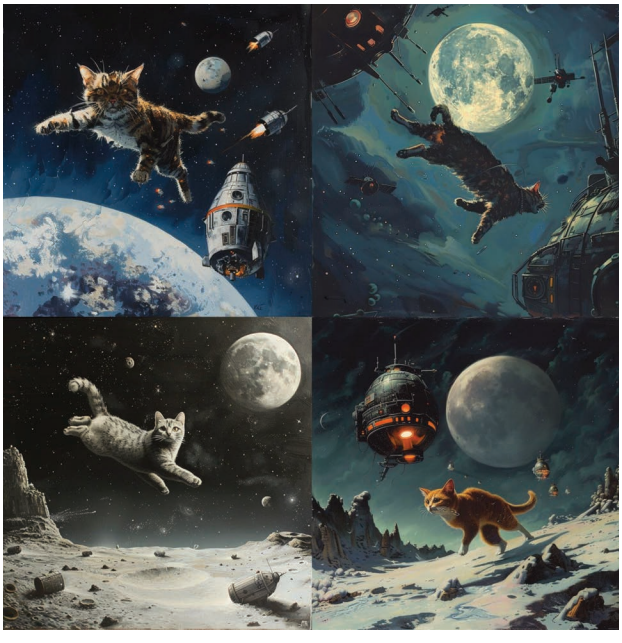
FIGURE 3. A dead cat bounce from one spacecraft to another under a moonlit sky.

to be something that I set in a workspace of some sort and don't have to type over and over again. All creative endeavors usually have some sort of desired art style, and most LLMs that I have tried will give you something if I don't specify it. That's kind of not OK; the workspace system should say, "Hey! You haven't specified the art style! Want to choose one from this list, or you want to draft it directly?" That would be way better than me having to enter the art style textually each time I want to see a new concept. Even better would be if it had a pulldown menu of some sort that allowed me to see what was rendered in newly selected