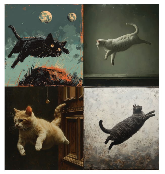
FIGURE 2. A dead cat bounce.